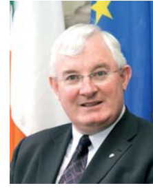
Noel Treacy, TD Minister of State for European Affairs