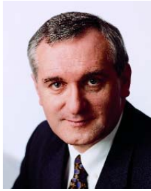
Bertie Ahern, TD Taoiseach