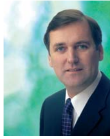
Tom Kitt, TD Minister of State with special responsibility as Government Chief Whip and for the Knowledge Society